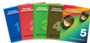
5 volume Chemical Demonstrations by Shakhshiri