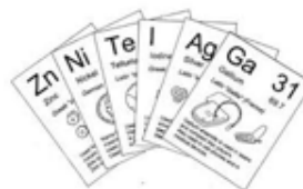
(1) Element Flashcards