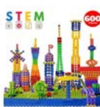
4 Funflakes sets