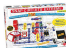
(10) Snap Circuits