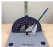
2 Pitsco Straw Rocket Launchers