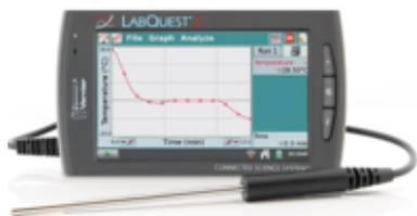
(7) LabQuest 2