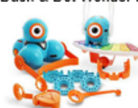
(6) Dash & Dot Wonder Packs