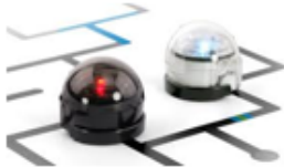
Ozobot Classroom Set