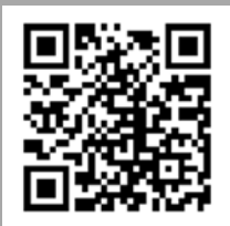
QR Code for USAFA K-12 STEM Outreach page