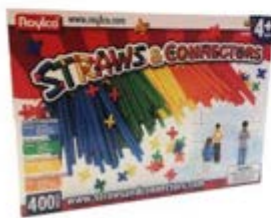
3 Straws and Connector sets