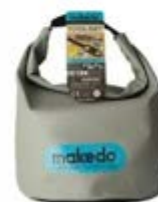
2 Makedo Cardboard Construction Kits