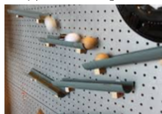
(6) Rube Goldberg Kits