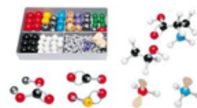
(20) Molymod Molecular Model Sets