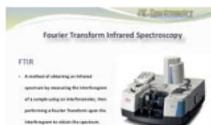
(1) Transform Infrared Spectrometer