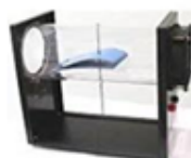
(2) Portable wind tunnels