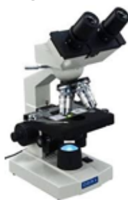
(5) Compound Microscopes