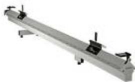
(2) 2m Air Tracks