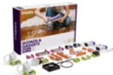
(7) Little Bits