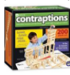
(14) Keva Contraptions