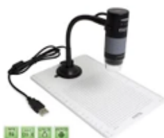
(7) Pluggable Digital Microscopes with prepared slides