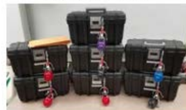
(12) Breakout Boxes