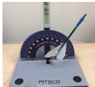
(2) Pitsco Straw Rocket Launchers