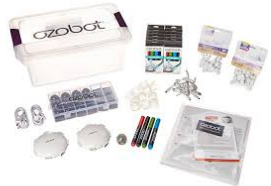
Ozobots Classroom Set